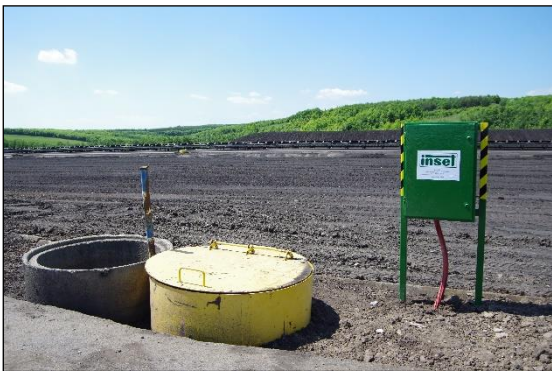
Figure 2. Readout base station (monitoring).

INSET Company carries out a comprehensive long-term geotechnical monitoring of the HCD built up on the spoil heap. Prior to construction, a monitoring system was set up in 1998 at the earliest. This consisted of particular probes and sensors that were linked to the readout base stations (see Figure 2).