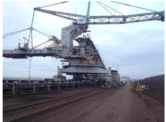
Figure 1. Stacker on the HCD site.

HCD, it is appropriate to carry out field tests. The purpose is to estimate the weight distribution of the stacker to the spoil heap body through the base layer of the improved soil (so-called “trunk”). The comparison of the achieved values from the individual field load-bearing tests makes it possible to determine the degradation of the trunk and the underlying soil, including the evaluation of the deformation and stability characteristics of the structure.