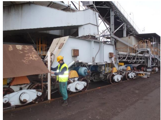
Figure 3. Geodetic measurements.

In order to also detect immediate changes in contact stress during the approach of the stacker and its movement over the sensors, some of them were connected in the measuring station to the data logger for continuous data readout.